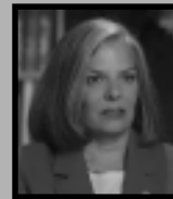
Julie Gerberding SARS