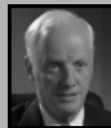
Frank Keating OK City Bombing